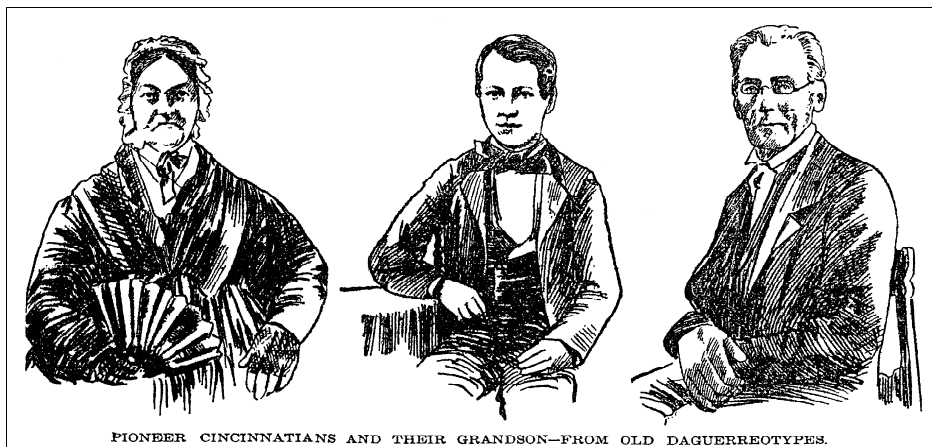
PIONEER CINCINNATIANS AND THEIR GRANDSON—FROM OLD DAGUERREOTYPES.

“You surely remember the famous divorce case between the Forrests. First he sued, and she brought a counter-petition, which, after a long and sensational trial, was decided in her favor. Her lawyer was Charles O’Conor, one of the greatest criminal lawyers of New York, while he was represented by the noted John Van Buren. The Courts awarded Mrs. Forrest $3,000 a year alimony, but her husband refused to pay. Finally, when the accumulated amount he owed his wife had reached $1110,000, he was compelled to pay her the sum in a lump. He was well able to do so, but was stubborn to the last.